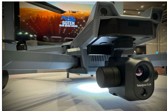
SOTEN with the infrared camera