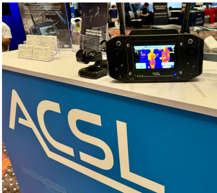
Smart Controller "TENSO"