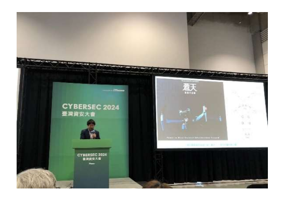
ACSL Speak at the conference